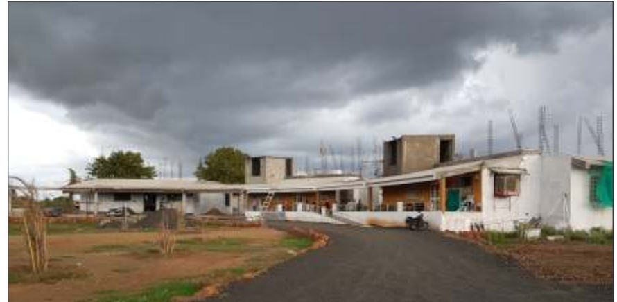
Under Construction Virat* Hospice Venue

A tertiary hospital for all class of cancer patients.