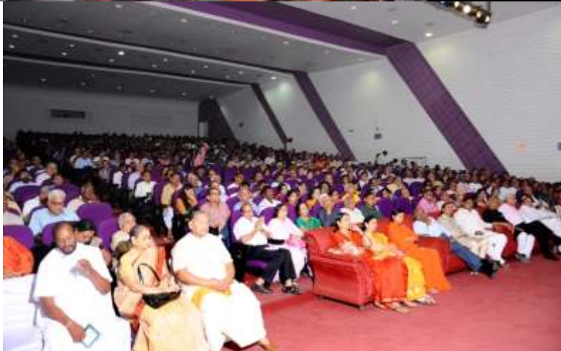
Annual Day of Virat* Hospice